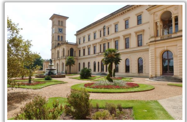
Osbourne House, UK