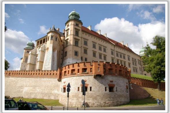
Wawel Castle, Cracow, Poland