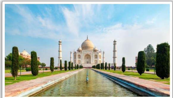
Taj Mahal, India