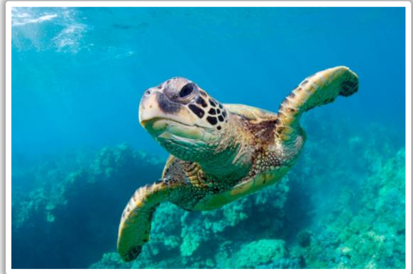
Turtle Conservation Centre, Cayman Islands