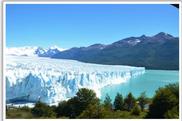
Glacier Perito Moreno, Argentina