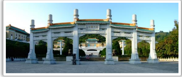
National Palace Museum, Taiwan