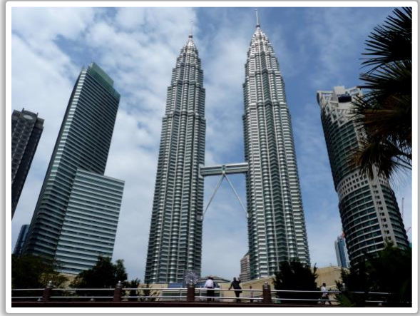
Petronas Twin Towers, Malaysia